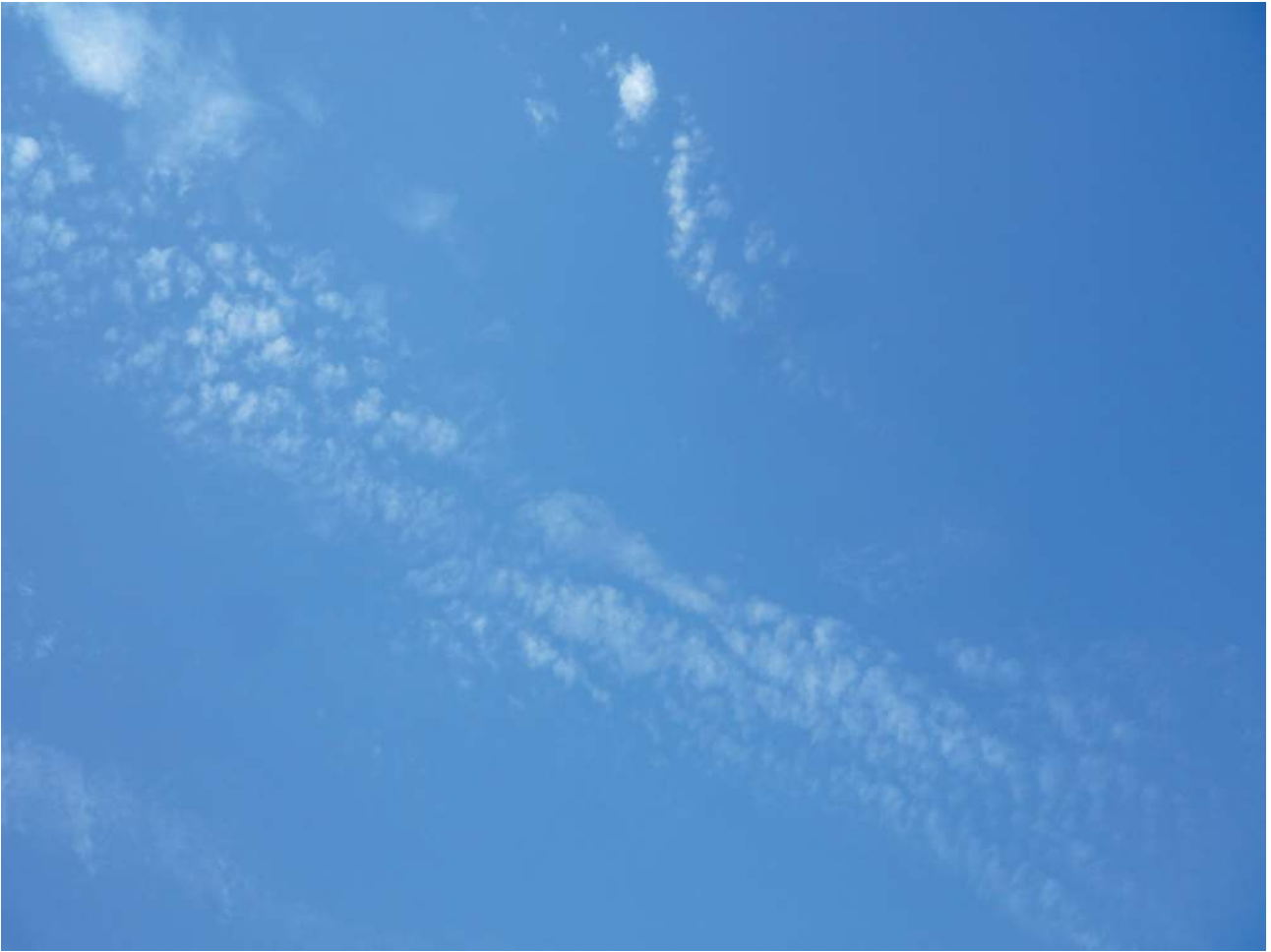
Fig. 4.2 for Question 4